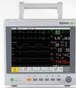
iM70 Patient Monitor