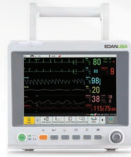
iM60 Patient Monitor