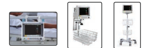
Bed Rail Hook